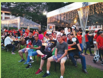
Taking a break