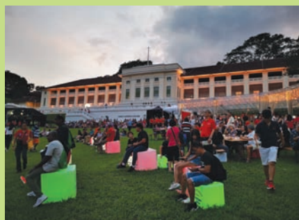
A Breezy Evening