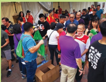
Receiving their goodies