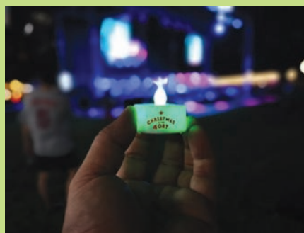
Christmas At The Fort

To many people, Christmas represents a time of festivities in giving and receiving presents, feasting on delicious food and decorating the Christmas tree but here at The Helping Hand, we know that Christmas represents more than that. Christmas is about God reaching out to His people through His son Jesus Christ who came into this world to save underserving sinners like us. So, while it is not wrong to enjoy the festivities, let us not forget that Christmas is about the birth of a Saviour who came to rescue men from their sins.