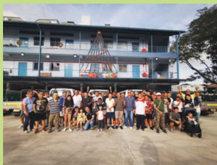
A Night At The Fort