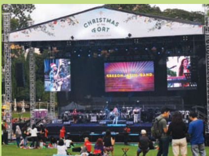
Latin music, anyone